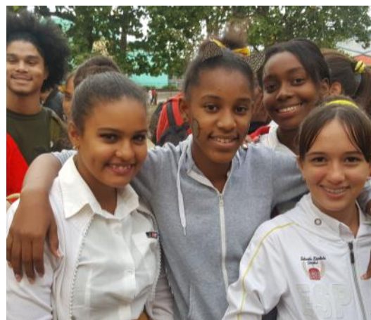
Students in a middle school in Havana

With support from The Christopher Reynolds Foundation, MEDICC's first CPHE Youth exchange in Cuba took place January 27-February 3, 2019, with 5 CPHE community leaders and 6 youth from Bronx, Milwaukee, Albuquerque, Navajo Nation and New Orleans. During the 6 months prior to traveling, everyone participated via conference calls in an interactive curriculum to help contextualize some of the expected experiences in Cuba. For example, after watching the film, Salud they then compared aspects of the film to their own personal lives. Seeing Cuban doctors who live and work in neighborhoods, Casey Long of Navajo Nation commented, “Older individuals who speak only the Navajo language don't want to go to doctors because they can't communicate in meaningful ways, and the hospitals and clinics are only in the larger towns, far from where people live.”