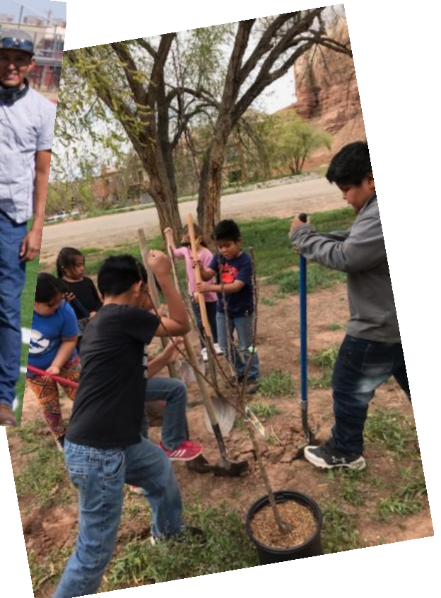
Right: Preparing soil to plant an apricot tree in a community garden