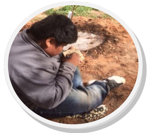
Bluff after-school art student holding his dedication plaque